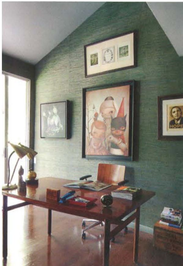
Fabric linen wallpaper sets the tone in the home office. The Danish desk follows form. It's made of warm, dark rosewood, a favorite material in mid-century design.