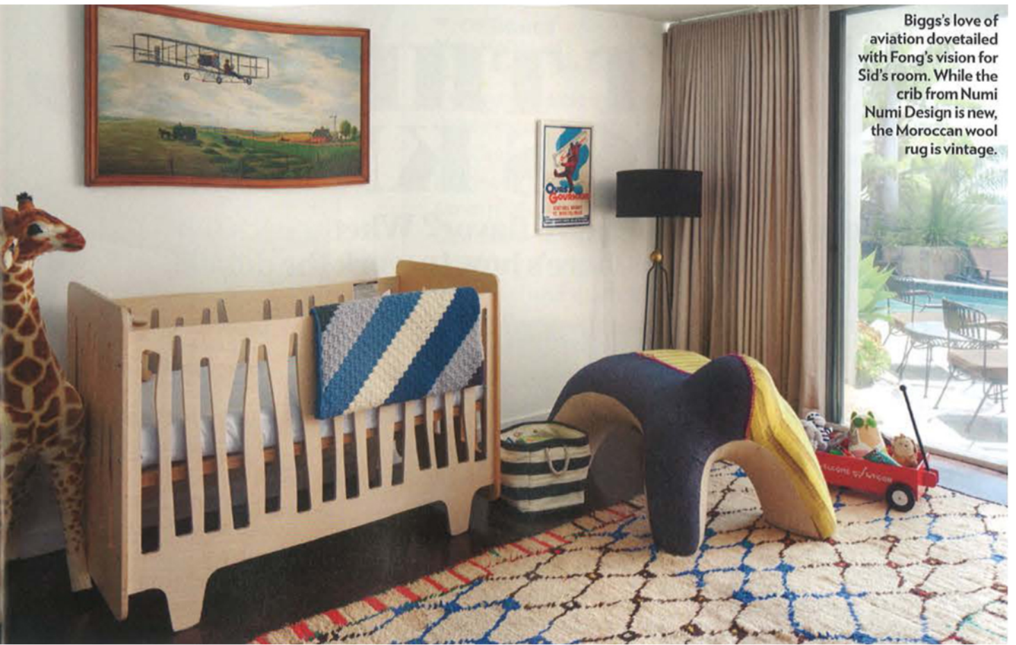
Biggs's love of aviation dovetailed with Fong's vision for Sid's room. While the crib from Numi Numi Design is new, the Moroccan wool rug is vintage.