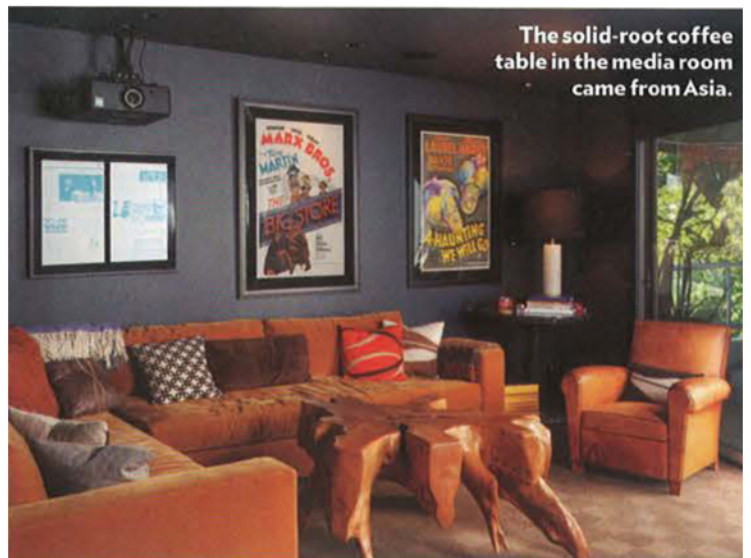
The solid-root coffee table in the media room came from Asia.