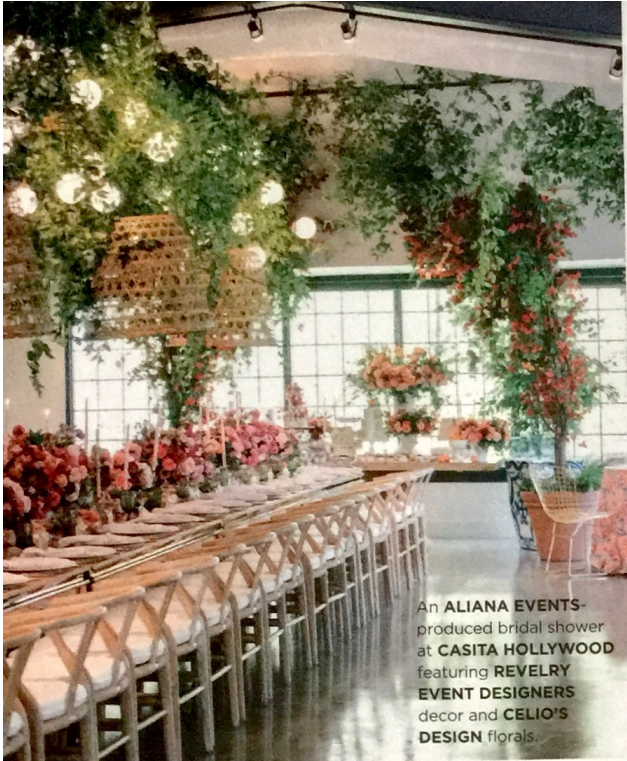
An ALIANA EVENTS-produced bridal shower at CASITA HOLLYWOOD featuring REVELRY EVENT DESIGNERS decor and CELIO'S DESIGN florals.

SET THE SCENE FOR ENCHANTED EVENINGS AT THREE VERSATILE NEW WEDDING VENUES